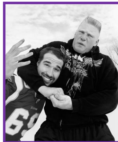
Photo of Jared Allen and Brock Lesner

Allen is one of the top three defensive ends in the National Football League. Machine players and family members have the opportunity to learn from Ju-Jitsu as well this season!